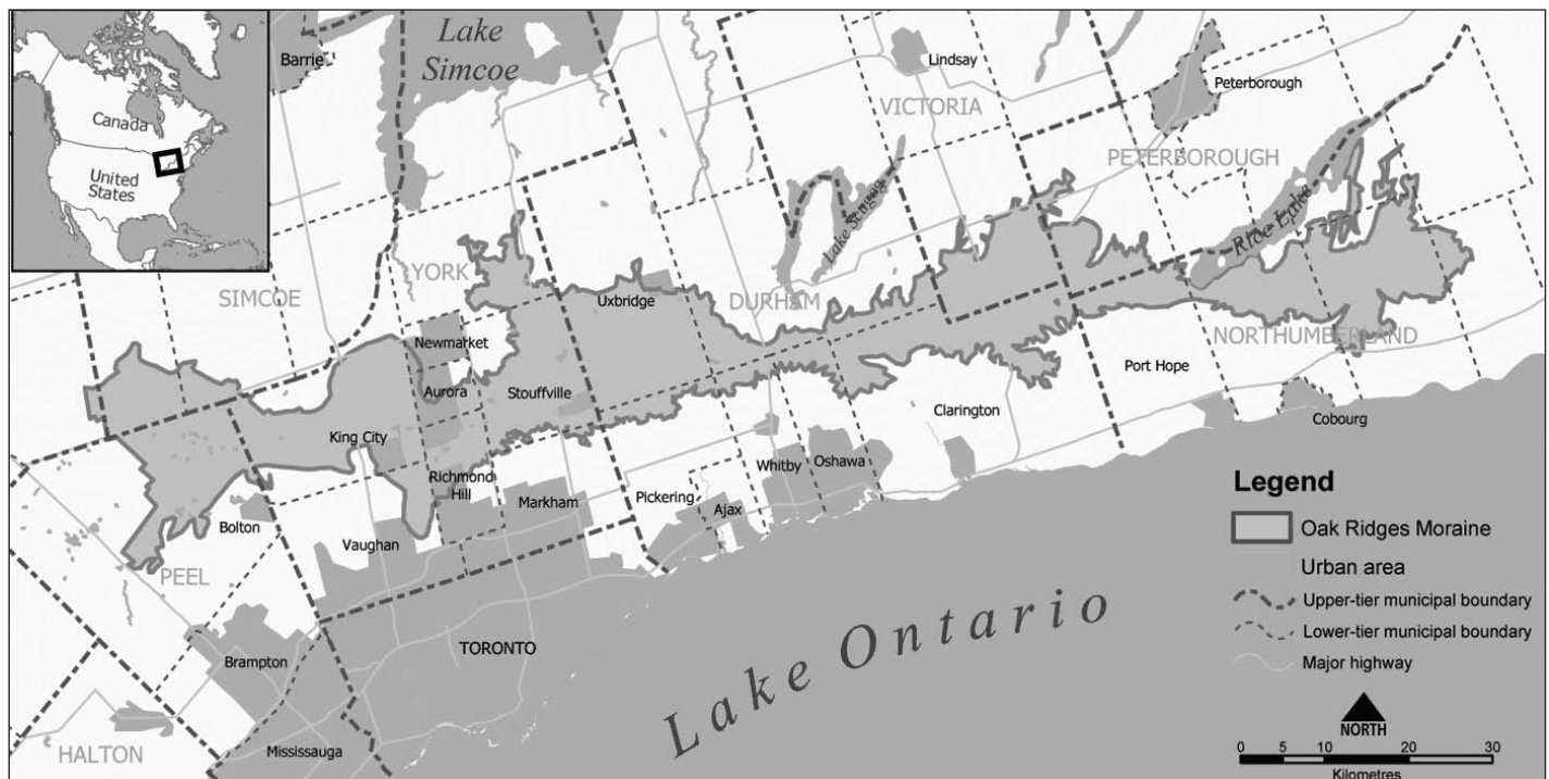
Oak Ridges Moraine map.

what impact the Toronto Star had on the Oak Ridges outcome, a content analysis of the Toronto Star's ORM coverage, and long interviews with six participants in the debate itself were conducted. Content analysis involves the systematic examination of communication or message, in this case using pro-conservation and