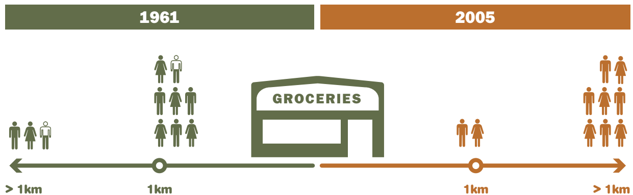
FIGURE: In 2005 less than 20% of London, Ontario’s inner-city population lived within 1 km of a supermarket, down from 75% in 1961.