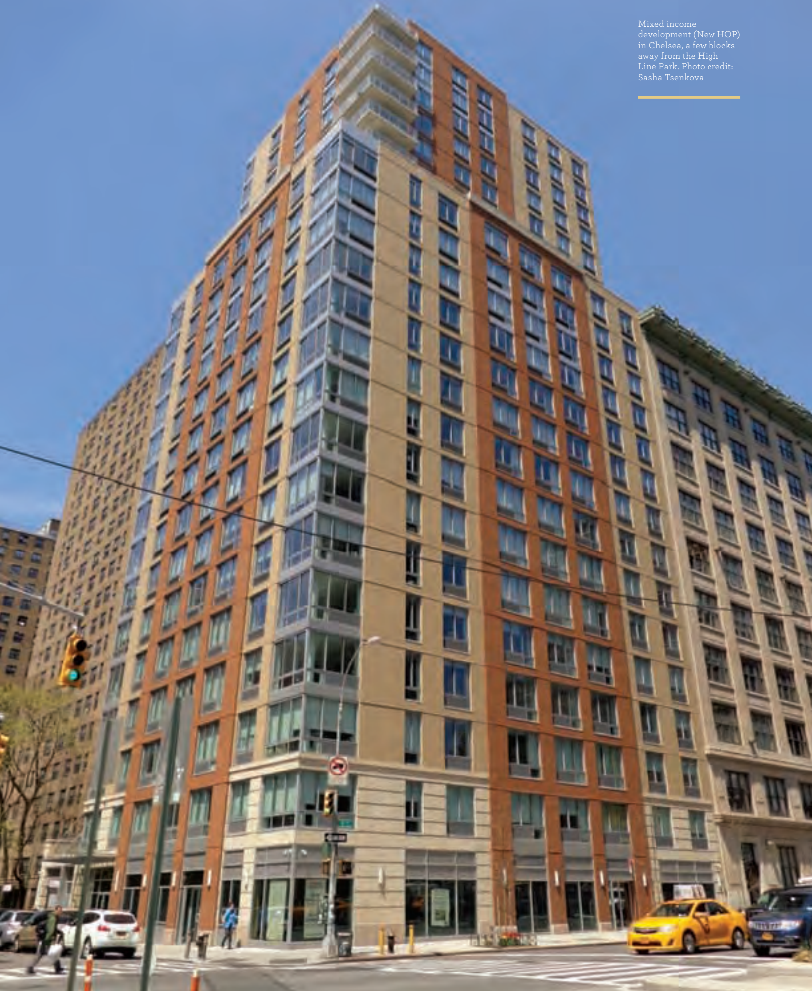
Mixed income development (New HOP) in Chelsea, a few blocks away from the High Line Park.